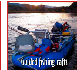
Guided fishing rafts