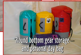
Round bottom gear storage and personal day bag