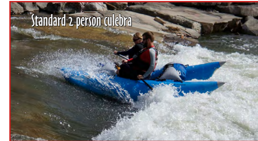
Standard 2 person culebra