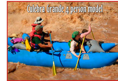
Culebra Grande 4 person model

To see 8 different frameless cataraft variations go to http://www.jpwinco.com/culebraspectable.htm