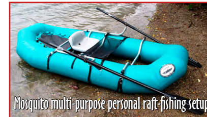
Mosquito multi-purpose personal raft-fishing setup