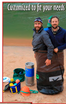
Customized to fit your needs