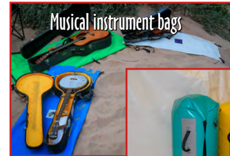
Musical instrument bags

Visit http://www.jpwinco.com/baginfo.htm for a list of standard dry bag capacities, custom dry bag ordering, and stories about how our dry bags perform.