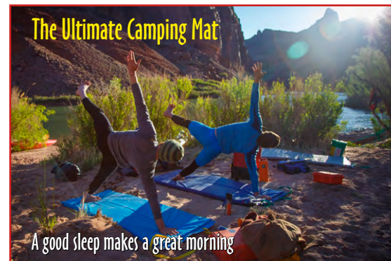
The Ultimate Camping Mat