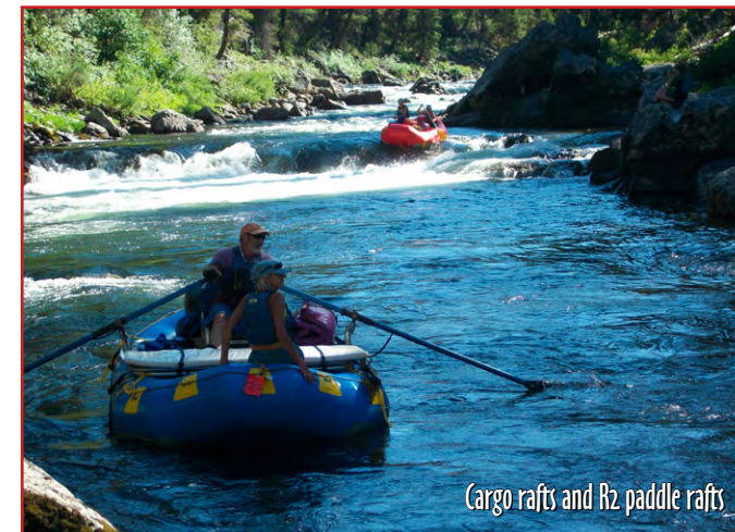
Cargo rafts and R2 paddle rafts

See 21 different Self bailing raft designs and prices at http://www.jpwinco.com/customselfbailingrafttable.htm